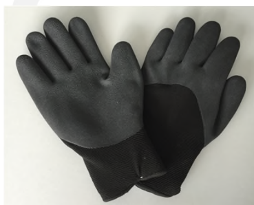
Reference standard :